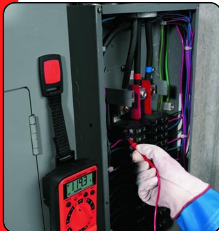
Magne-Grip™ holster frees both hands for work